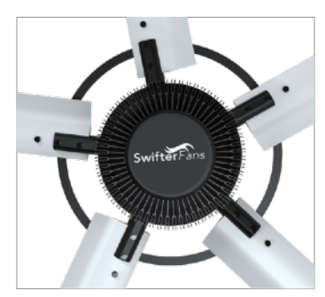
Diameter: 16' - 24' (custom available)